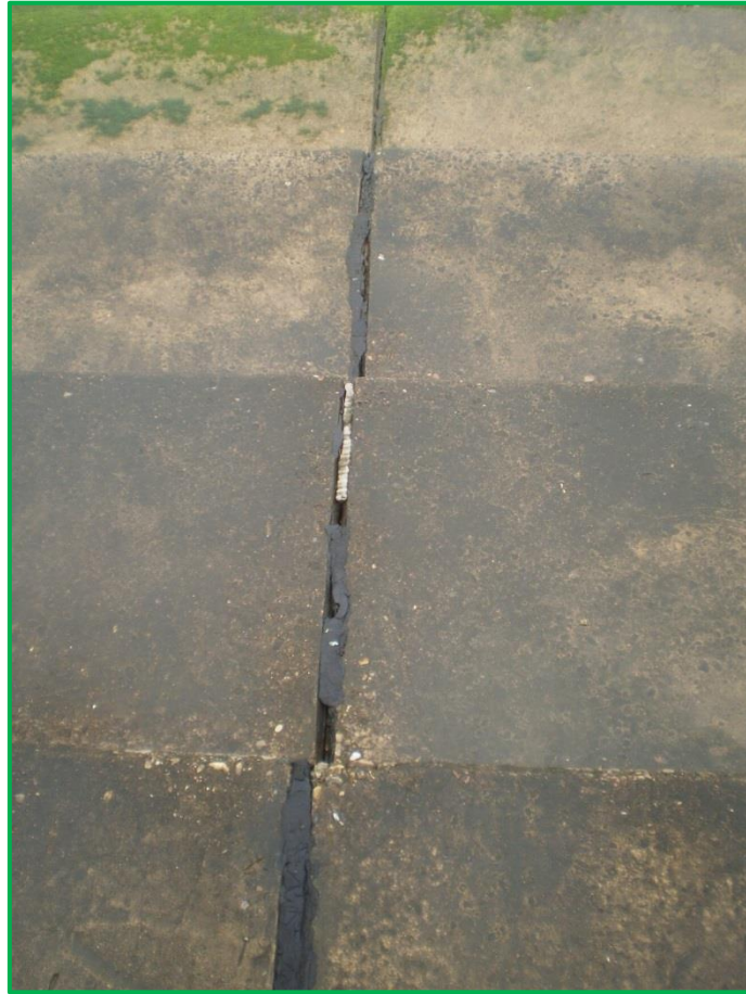
Damaged sealants to be replaced