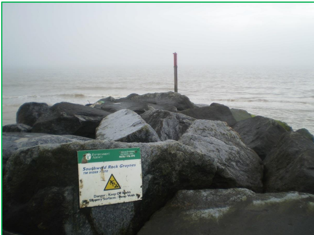
Damaged Navigation marker to be repaired