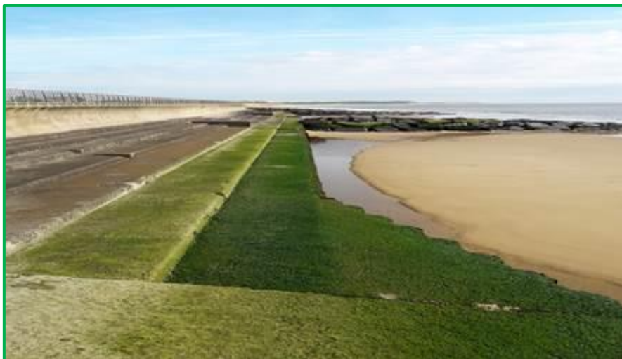
Green algae from the seawall steps to be removed